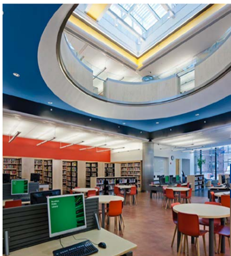
KENSINGTON BRANCH LIBRARY First floor Reading Room, Young Adults